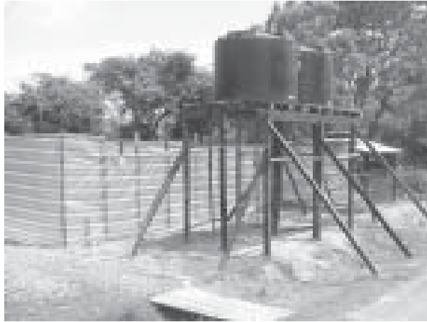
Bathing place for women

Separate bathing areas for women were constructed in all four camps. We are happy to note that this facility exists only in the four camps mentioned above.