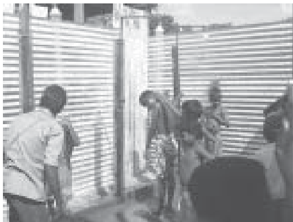
The first bath