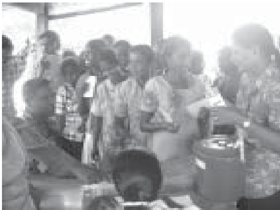
Mothers' nutrition pack distribution