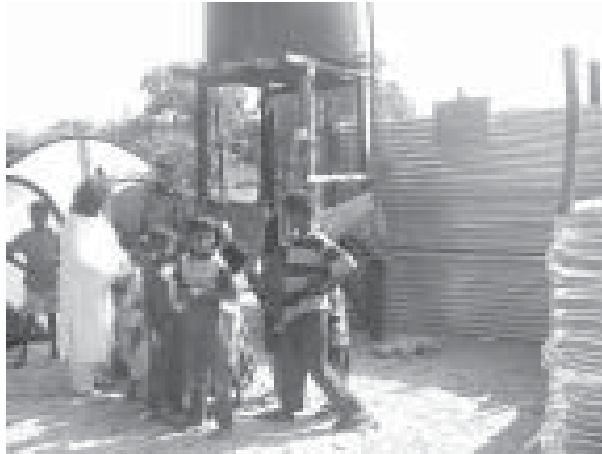
New tank for bathing