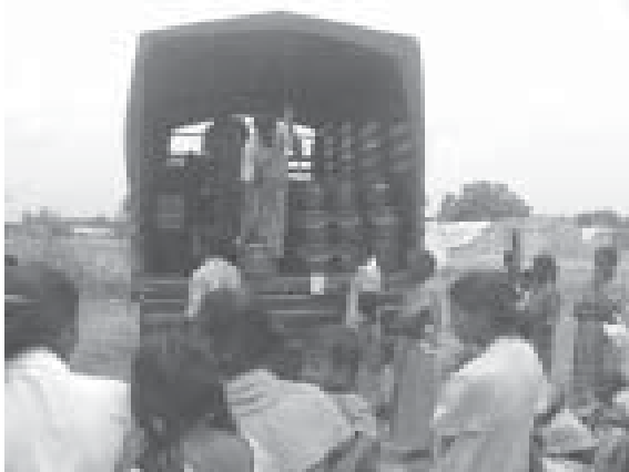
Unloading mothers' nutrition packs