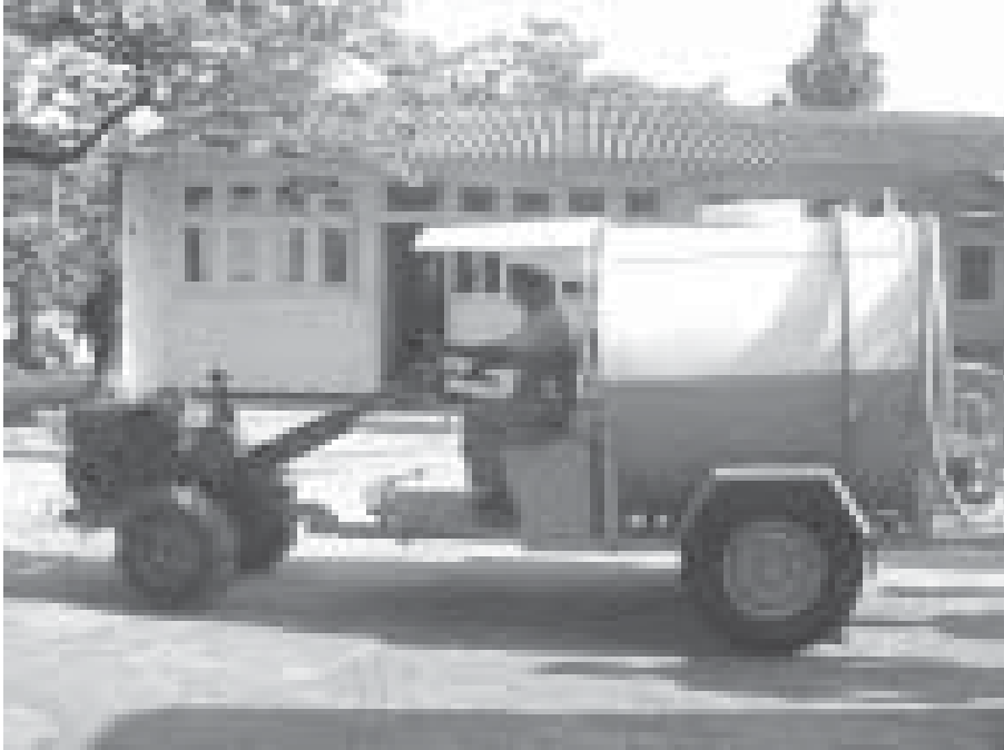
New Water Bowser

On this visit our volunteers conducted a survey for a proposed project of providing workmen with their tools of trade. Details of this survey are given below.