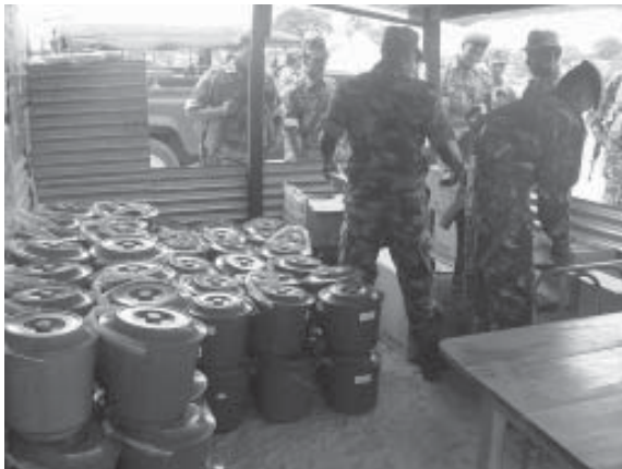
Special Task Forces stacks up nutrition packs