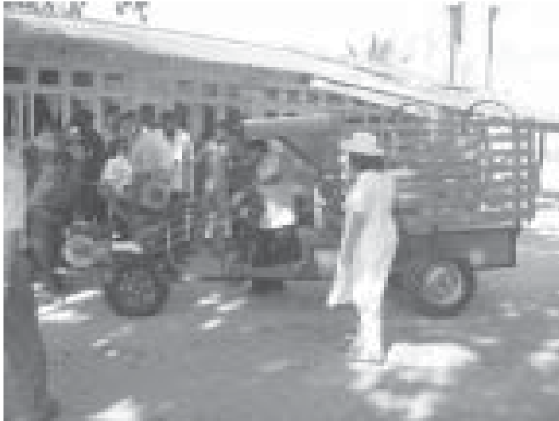
Learning to operate the Tractor Trailer

The mobile tractor bowser unit, the second piece of equipment, has a capacity of 450 gallons. Fitted with a 2 inch gate valve and a delivery hose 18 inch manhole and a 1 inch vent pipe, the tank is fitted to the chassis of the trailer and could be removed for any purpose if required. Unlike in a steel tank bowser, there is no algae formation or corrosion or unhygienic reaction in water and is mostly made for delivering water. Furthermore, the trailer is made with strong steel structure with wheels of 15 inch size and a hitch attachment to be pulled by a 2-wheel tractor. This piece of equipment was funded by The 10 Dollar Foundation, USA and supplied by Farmers (Private) Limited. This bowser is presently being used in the largest of the four camps and is providing drinking water to distant areas.