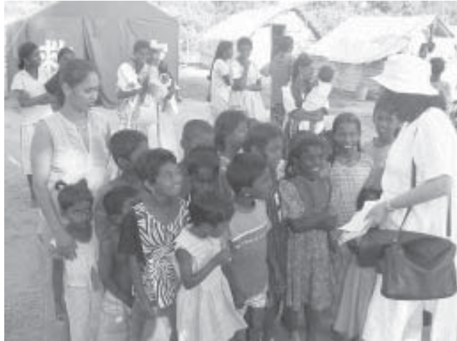
Tsunami Survivors, Komari