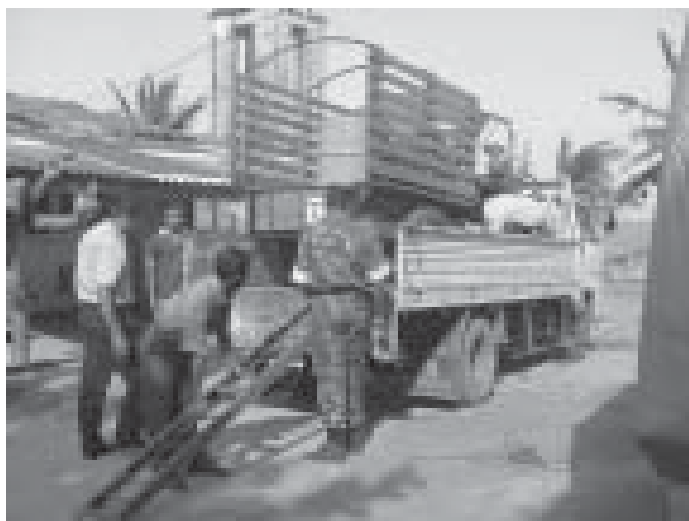
Uploading the new Water Pump Trailer

The mobile tractor bowser unit, the second piece of equipment, has a capacity of 450 gallons. Fitted with a 2 inch gate valve and a delivery hose 18 inch manhole and a 1 inch vent pipe, the tank is fitted to the chassis of the trailer and could be removed for any purpose if required. Unlike in a steel tank bowser, there is no algae formation or corrosion or unhygienic reaction in water and is mostly made for delivering water. Furthermore, the trailer is made with strong steel structure with wheels of 15 inch size and a hitch attachment to be pulled by a 2-wheel tractor. This piece of equipment was funded by The 10 Dollar Foundation, USA and supplied by Farmers (Private) Limited. This bowser is presently being used in the largest of the four camps and is providing drinking water to distant areas.