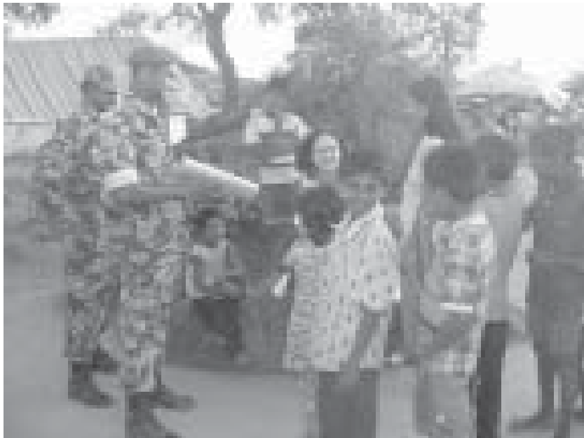
Helpful advice from the Special Task Force